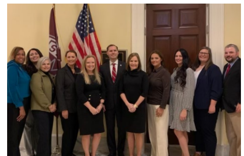
■ MACCA with Representative Michael Guest