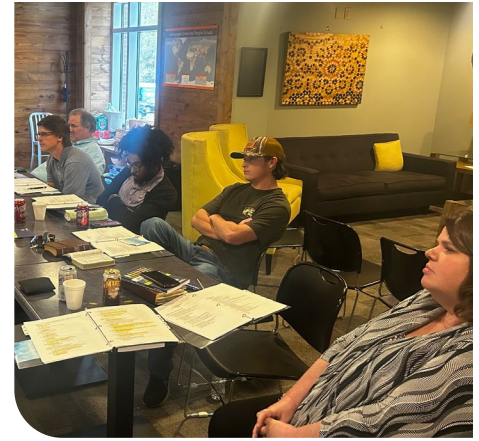
■ More Volunteer Training

"The harvest is plentiful, but the laborers are few. Therefore, pray earnestly to the Lord of the harvest to send out laborers into his harvest." - Luke 10:2