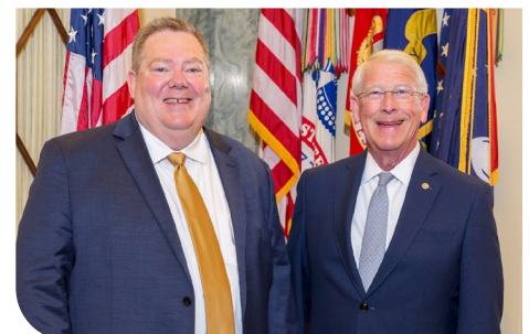
■ Sean Milner with Senator Trent Lott