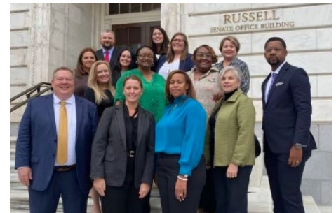
■ MACCA On the Senate Building Steps